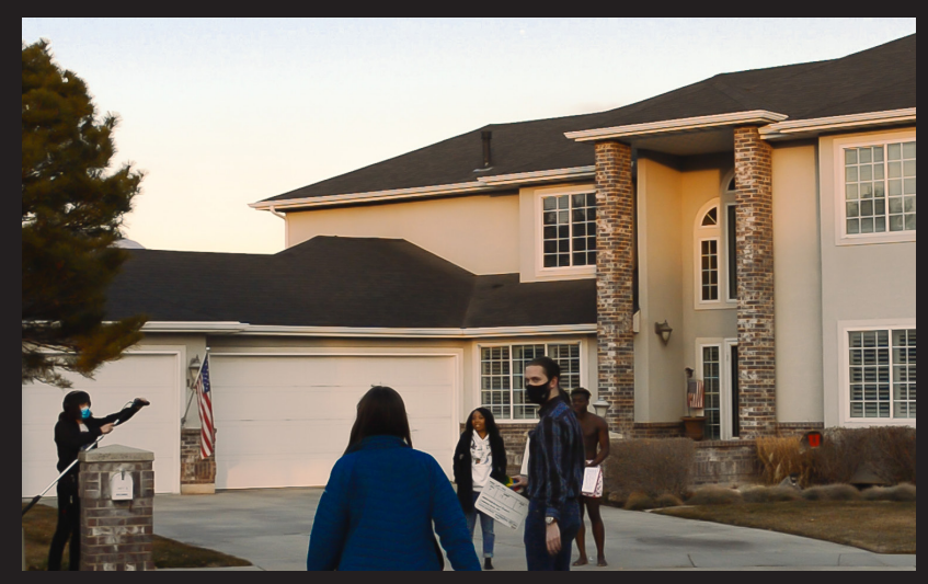
On the final day of principal photography, the producers block an exterior scene with Tako and Brown.

Production began on A Full House in December 2020. After nine months of the COVID-19 pandemic, it was clear that acting jobs and opportunities for creative work were not rebounding as quickly as other sectors of the economy. With the hope that all parties could keep their skills sharp over the winter break, Wandering Productions invited a handful of friends and creatives to collaborate on a short project -- the nature of the project yet to be determined.